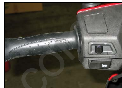
Left Handlebar Controls Turn Signal Control, Horn