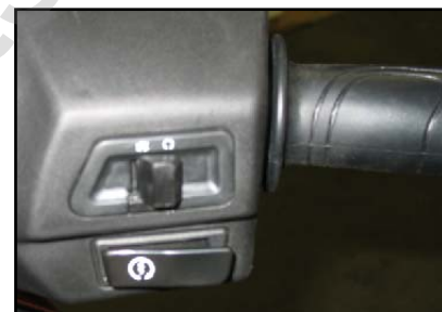
Right Handlebar Controls Stop Switch, Starter Button